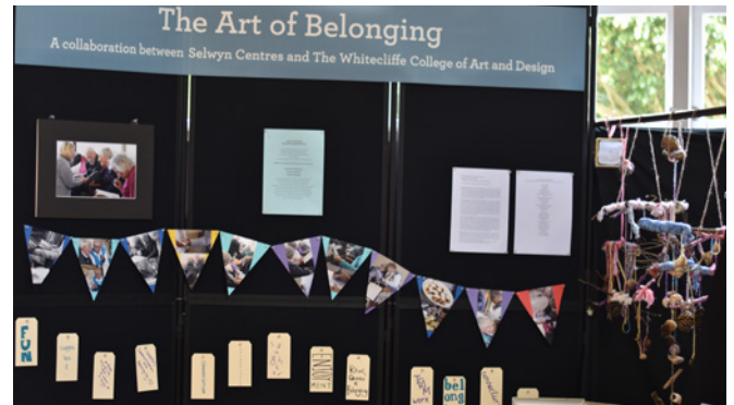
The Art of Belonging exhibition featured work by guests of the Waiuku and Whangapāraoa Selwyn Centres.

Selwyn Centres are community drop-in centres for older people hosted in partnership with Anglican parishes. To find a Centre near you, visit selwynfoundation.org.nz/community/social-engagement/selwyn-centres