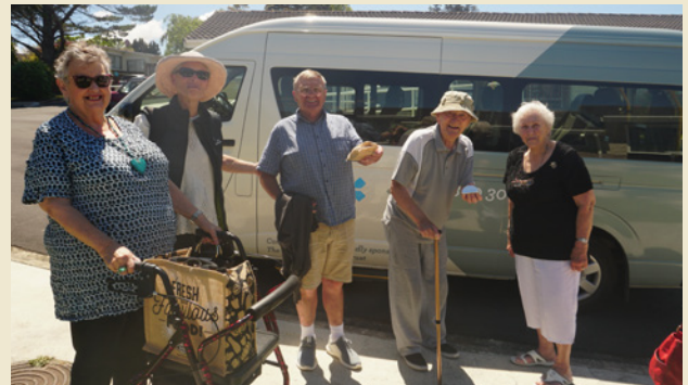
Haumaru Housing tenants from Sunnynook's Cockayne Court and Milford's Stratford Court enjoy a day trip to the picturesque Puhoi Valley in the Selwyn community minivans.

For further information, visit haumaruhousing.co.nz