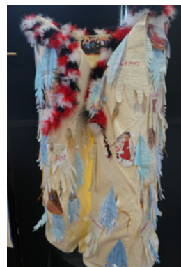
The Royal Oak Selwyn Centre's Korowai, adorned with cut-out hand outlines of the guests, resembled a hug or two arms gathering people together for their weekly catch-up at the Centre.