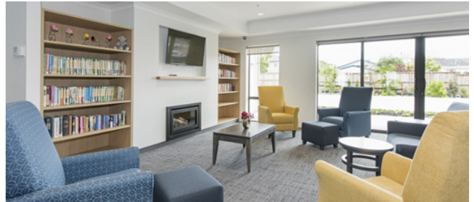
A typical household lounge area in the new Ivan Ward Centre

For more information, visit selwynfoundation.org.nz/villages/residential-care/selwyn-village/living-options