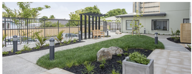
The Brian Wells House memory support garden