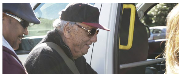
'All aboard!' A Haumaru Housing tenant climbs aboard for a day out in one of our new community minivans.

In addition, following the purchase of three minivans thanks to a generous grant from the Stevenson Village Trust, it's now offering community transportation services and social outings for tenants of Haumaru Housing villages and other older people living in the community, thus assisting even more people to stay connected and socially engaged within their neighbourhoods.