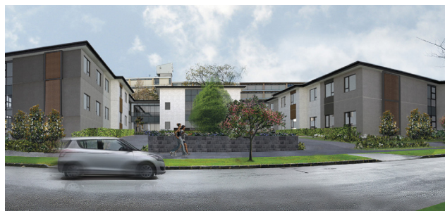
Artist's impression of the new Ivan Ward Centre